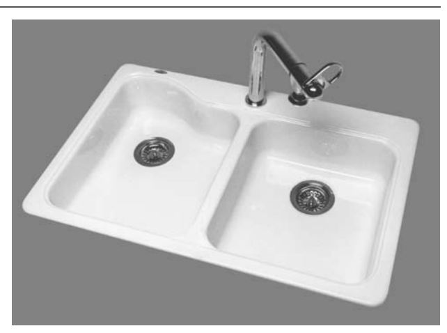
Silhouette Shallow Double Bowl

☐ 791326-100 Mounting Kit (consists of cut-out template and mounting clips)